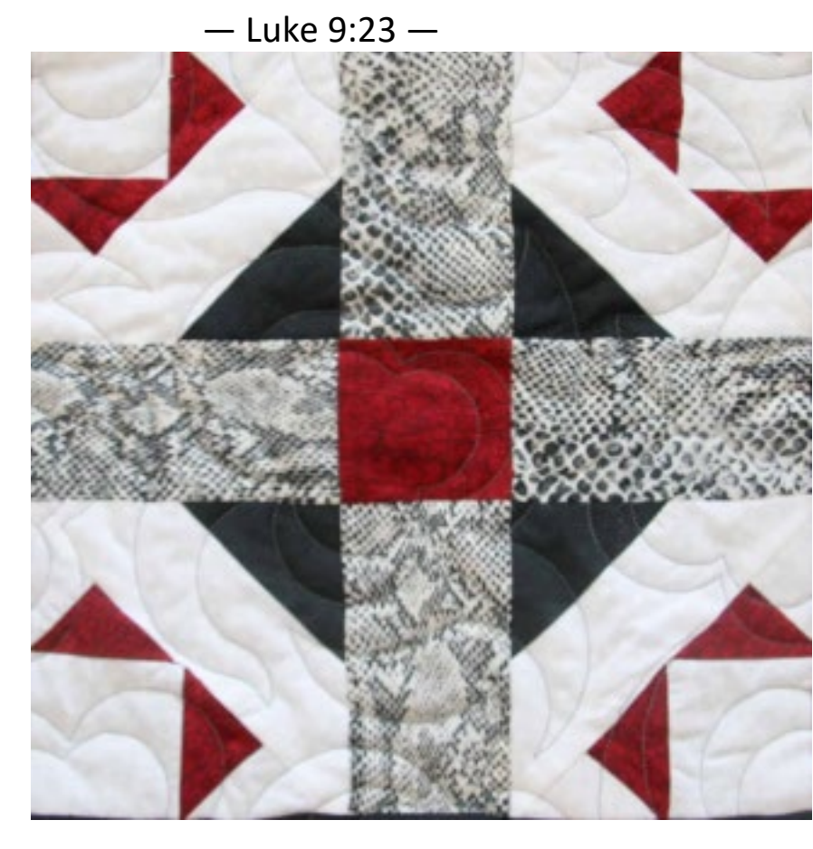
Cross and Crown

"Then He said to them all, "If anyone desires to come after Me, Let him deny himself, and take up his cross daily, and follow Me."