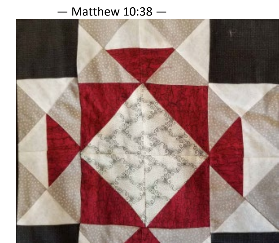
Crown of Thorns

"And he who does not take his cross and follow after Me is not worthy of Me."